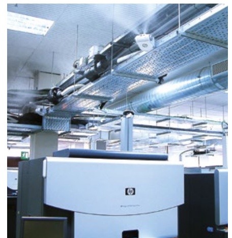
Optimum humidity protects digital printing systems from electrostatics