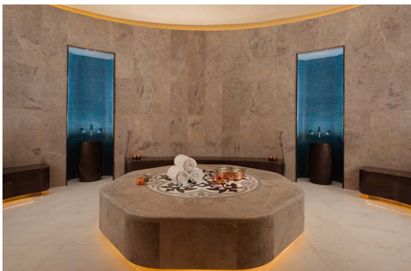
Hammam of Sheraton Hotel Astana