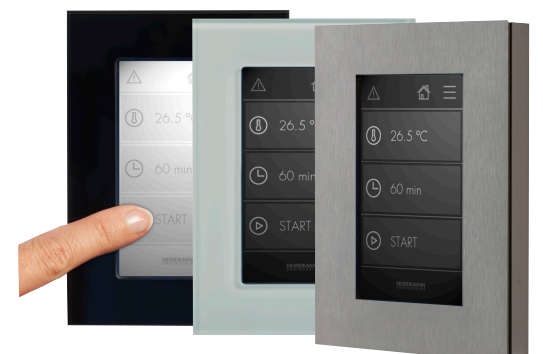
The external display in three versions

construction, however, also allows steam bath builders to individualize the fitting with a material of the customer's liking.